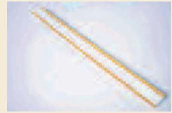
Multi purpose trim